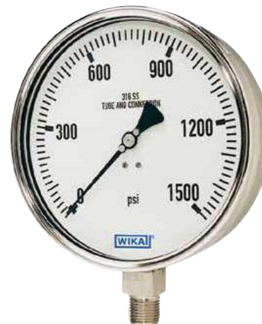
Bourdon Tube Pressure Gauge Model 232.50

Ambient: -40°F to +140°F (-40°C to +60°C) - dry -4°F to +140°F (-20°C to +60°C) - glycerine-filled -40°F to +140°F (-40°C to +60°C) - silicone-filled